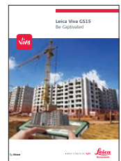
Leica Viva GS15